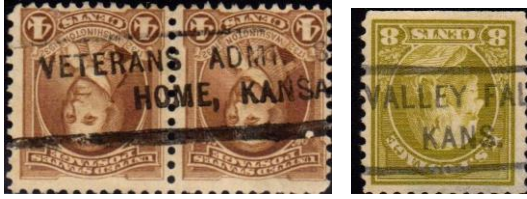
4.4643 long-box roller and another