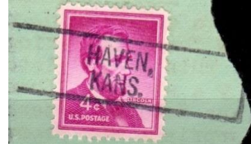
2.4644 long box

The state is normally abbreviated, KANS., unless listed (Ie: KAN., or KS)