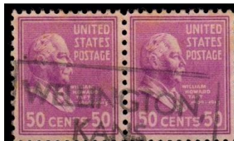
2.466454 and sim, larger