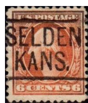
2.46004 nara T/S and a sim 2.46