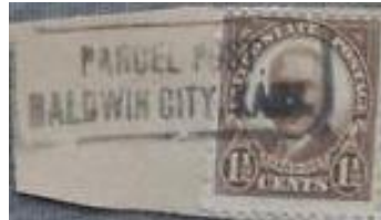
2.4614 and the same, off paper