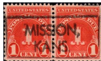
2.466554 and sim, smaller