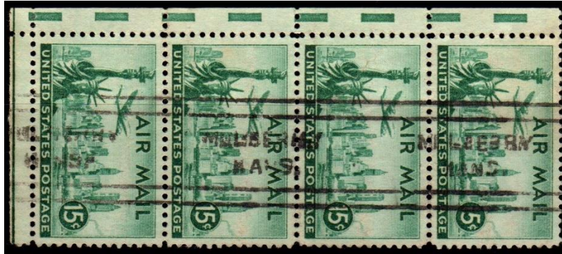
7.4643 DLR double-line roller