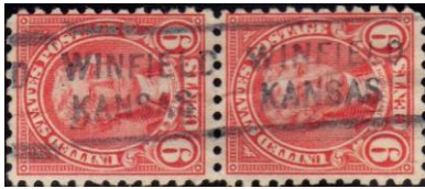
no vertical box line