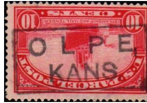
2.46742 and a heavier impr